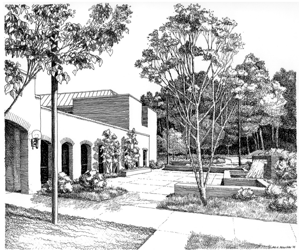
“Where Faith and Life Connect”

The Order of Worship January 14, 2018 9:00 and 11:00 A.M.