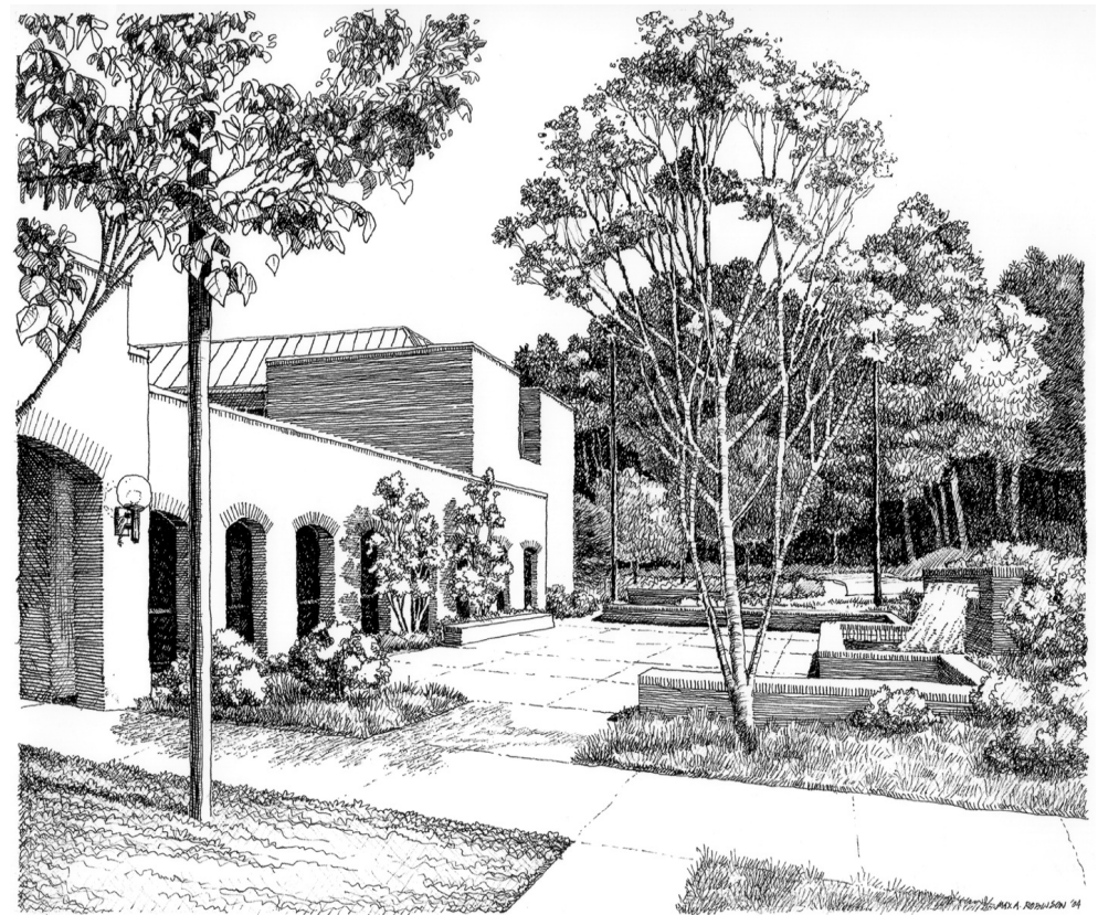
“Where Faith and Life Connect”

The Order of Worship January 21, 2018 9:00 and 11:00 A.M.