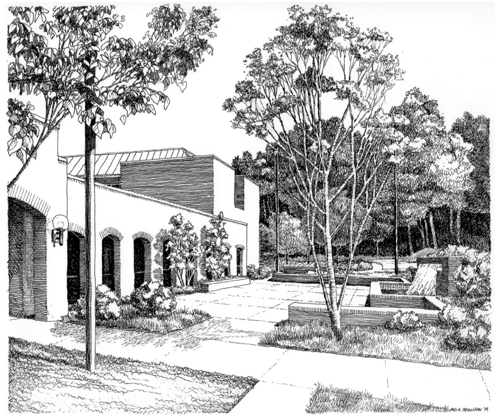
“Where Faith and Life Connect”

The Order of Worship January 28, 2018 9:00 and 11:00 A.M.