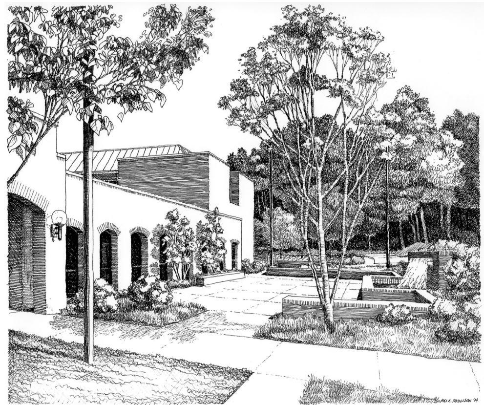
“Where Faith and Life Connect”

The Order of Worship February 11, 2018 9:00 and 11:00 A.M.