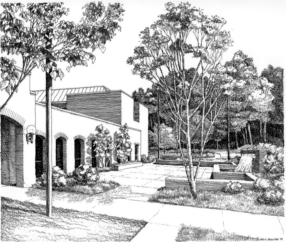
“Where Faith and Life Connect”

The Order of Worship April 22, 2018 9:00 and 11:00 A.M.