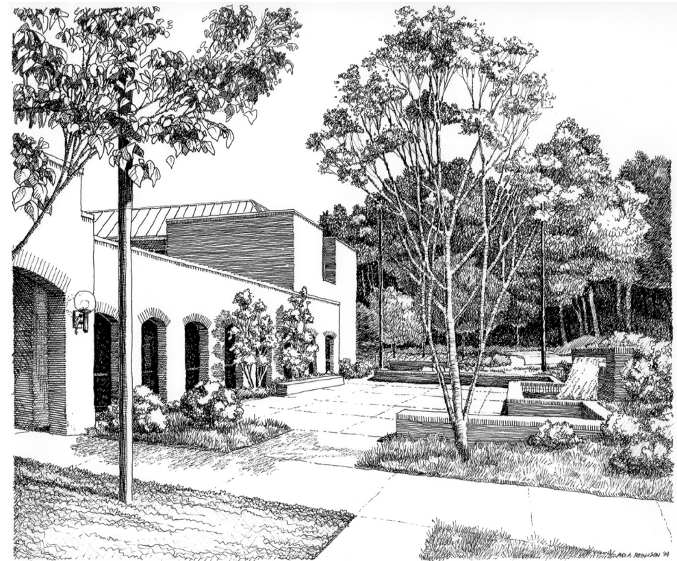
“Where Faith and Life Connect”

The Order of Worship June 10, 2018 10:00 A.M.