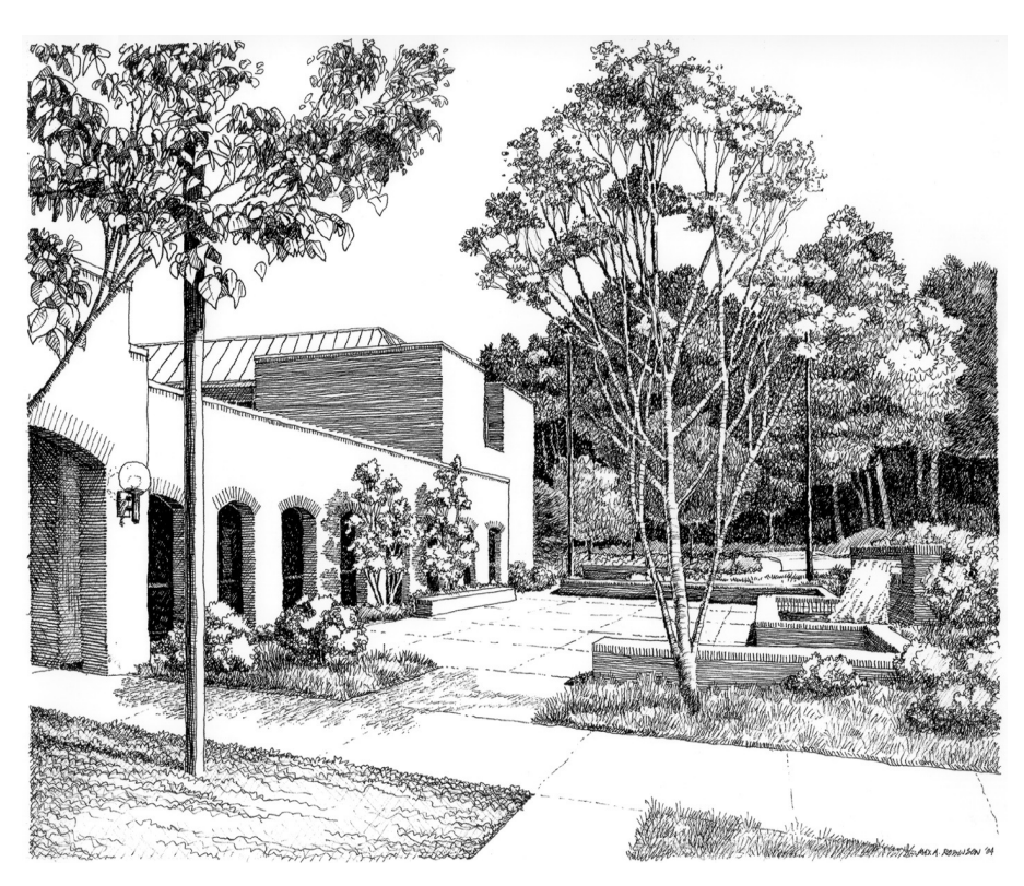
"Where Faith and Life Connect"