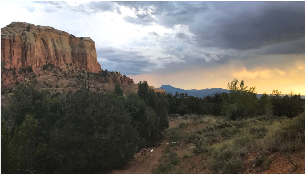
The Order of Worship "Where Faith and Life Connect"