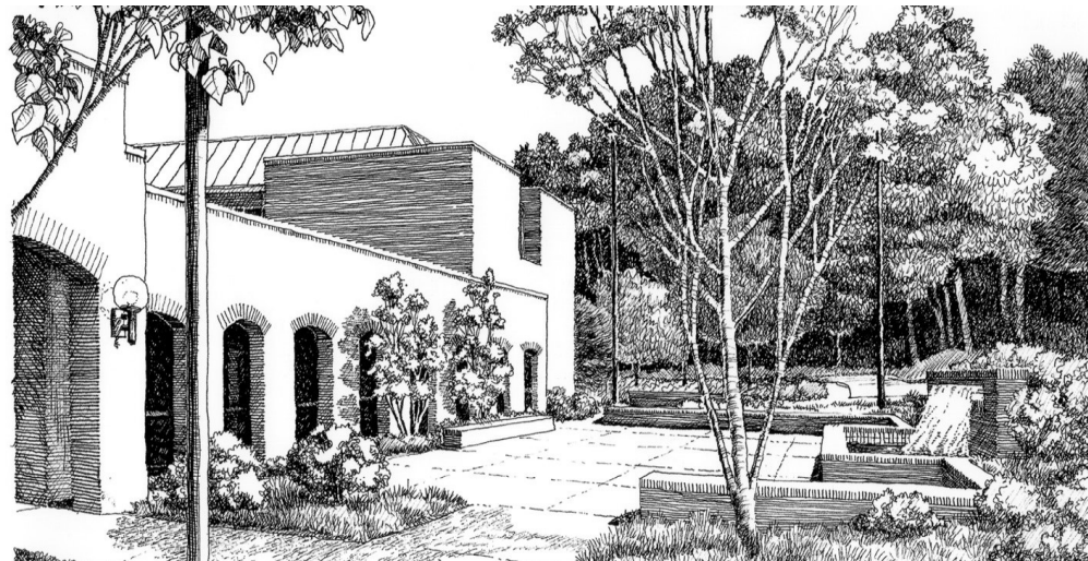
“Where Faith and Life Connect”

The Order of Worship December 29, 2019 11:00 A.M.