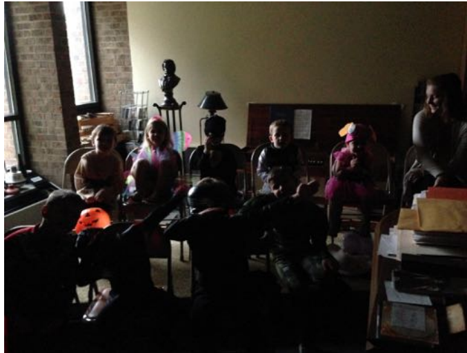
Halloween Party 2019, during Westminster's extended power outage

Westminster's commitment to its children is seen very early on in its emphasis on education and inclusion, both in Christian Education and music. A member of Westminster Choristers, who had begun her musical journey in Westminster's pre-school choir and grown up through the various young choirs, shared during her reflection on Senior Sunday that she could never remember a time when she didn't sing. That is deeply meaningful to me and affirming—it is the crux of my passion and my musical calling to help each child discover their voice and inner musician, reveal their innate ability, and promote a deep love and appreciation for all kinds of music. I also believe firmly in the legendary musical educator Shinichi Suzuki's (Suzuki method) philosophy that every child has talent and ability. Creativity is a precious human attribute and singing a most important life skill—activities every person can do and enjoy, though they require nurture and instruction. This is best started at an early age, while the brain is “blooming.”