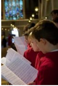
A cathedral choir's trebles