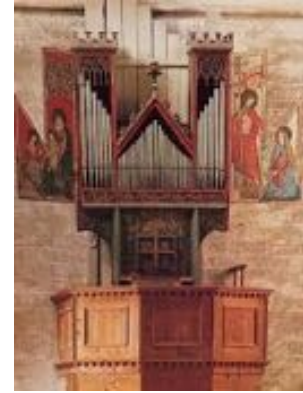
Sion, Switzerland, the oldest organ still playable

The music program at Westminster Church continues its ministry of building community and leading the music of worship together. Choir members are actively involved in every aspect of the church's life and steadfastly devoted and committed to our efforts, for which I'm most grateful, and I look forward to the many opportunities for musical growth and sharing in worship the choirs continually afford the congregation. Everyone in the Westminster community is invited and encouraged to become involved. The choirs cannot flourish and effectively serve without you . As the church receives its life from the diverse gifts of its members, so too does each choir. We are a connectional church and we build up our church's body through the wonderful bonding and interaction that take place in small groups such as choirs. Our program is designed to cultivate the musical contributions to worship of the entire congregation and we have a seat waiting for you!