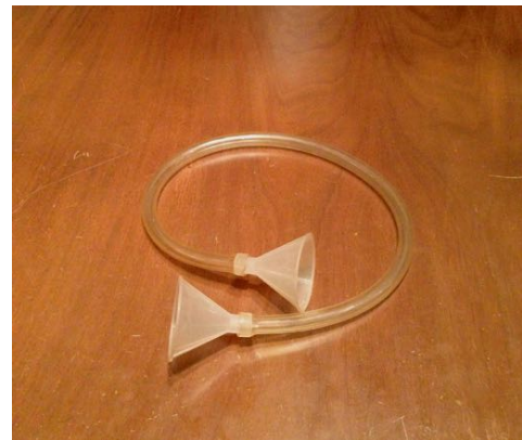
"The Tube" helps each child hear their own voice more acutely. The brain then aligns their aural input with their vocal production, allowing them to match pitch.