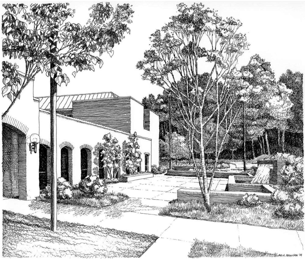
“Where Faith and Life Connect”

The Order of Worship August 7, 2022 10:00 A.M.