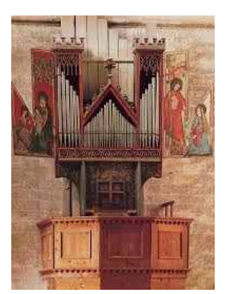
Sion, Switzerland, the oldest organ still playable

The music program at Westminster Church continues its ministry of building community and leading the music of worship together. Choir members are actively involved in every aspect of the church's life and steadfastly devoted and committed to our efforts, for which I'm most grateful, and I look forward to the many opportunities for musical growth and sharing in worship the choirs continually afford the congregation. Everyone in the Westminster community is invited and encouraged to become involved. The choirs cannot flourish and effectively serve without you . As the church receives its life from the diverse gifts of its members, so too does each choir. We are a connectional church and we build up our church's body through the wonderful bonding and interaction that take place in small groups such as choirs. Our program is designed to cultivate the musical contributions to worship of the entire congregation and we have a seat waiting for you!