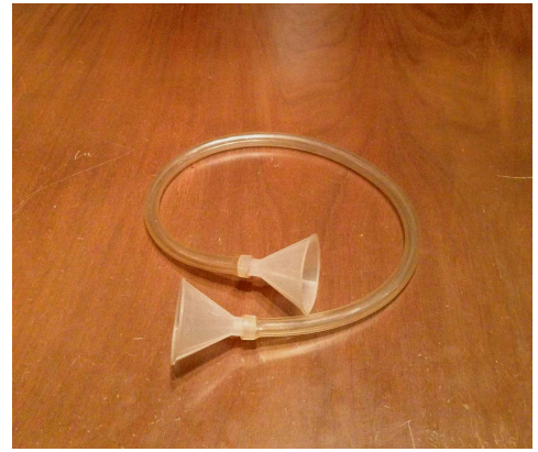
"The Tube" helps each child hear their own voice more acutely. The brain then aligns their aural input with their vocal production, allowing them to match pitch.