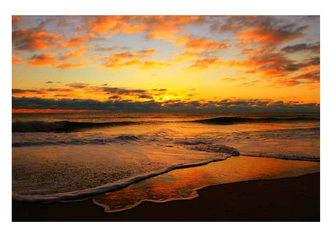
The Order of Worship