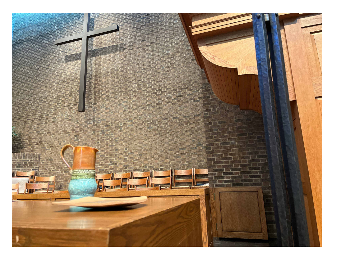
The Order of Worship

September 3, 2023 9:00 and 11:00 A.M. Sacrament of the Lord's Supper