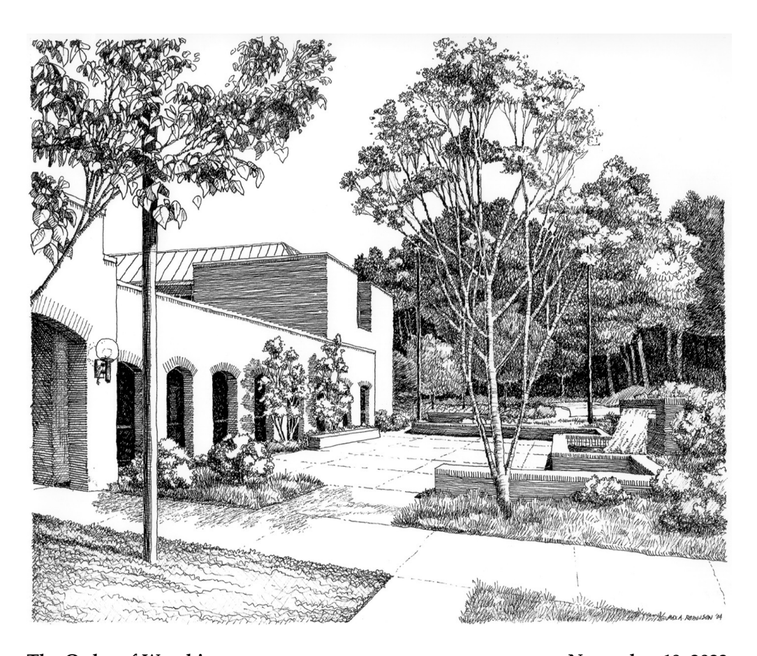
The Order of Worship