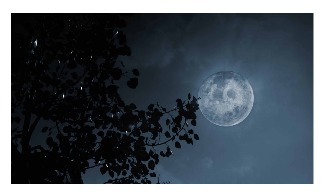
The Order of Worship