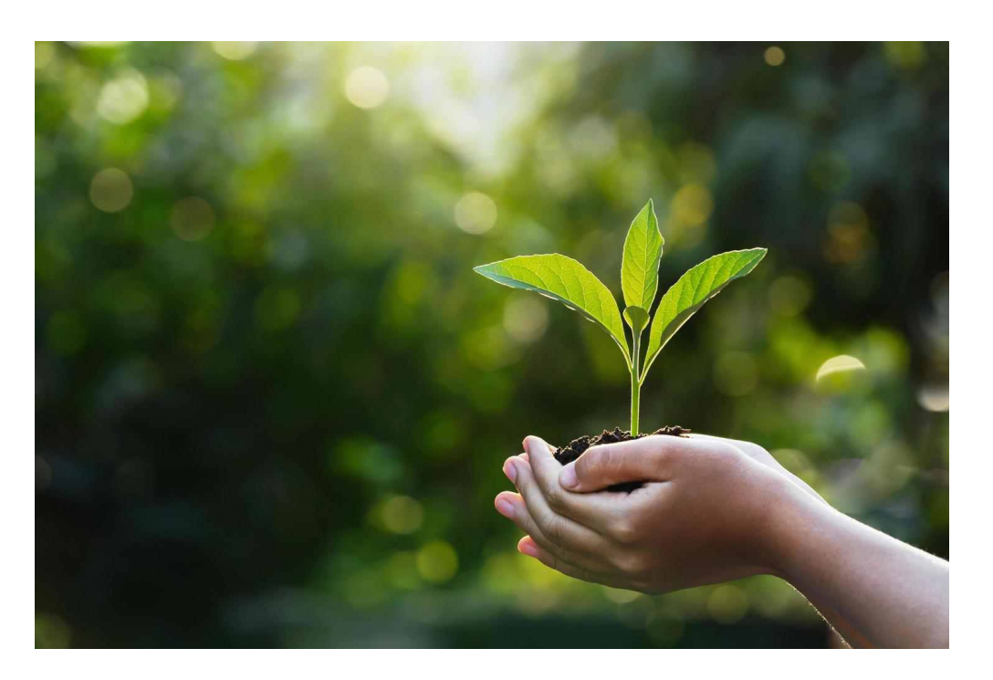
The Order of Worship