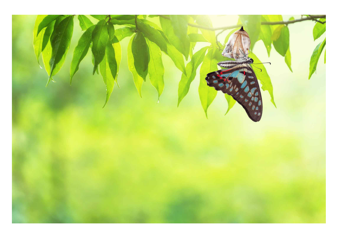
The Order of Worship