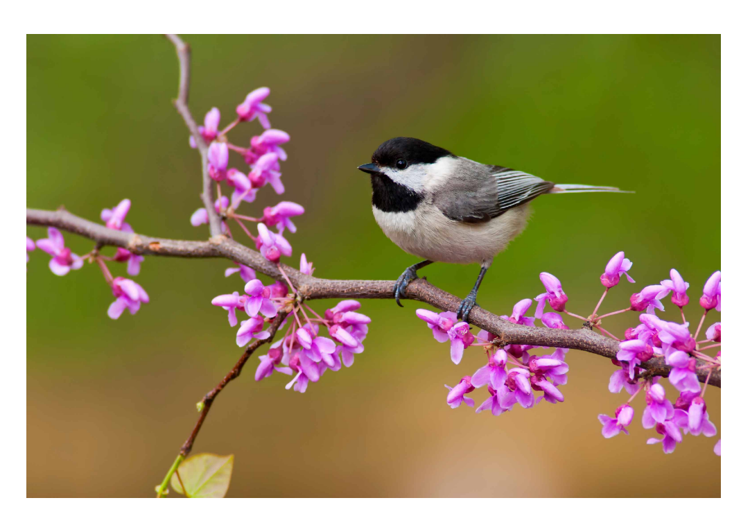
The Order of Worship