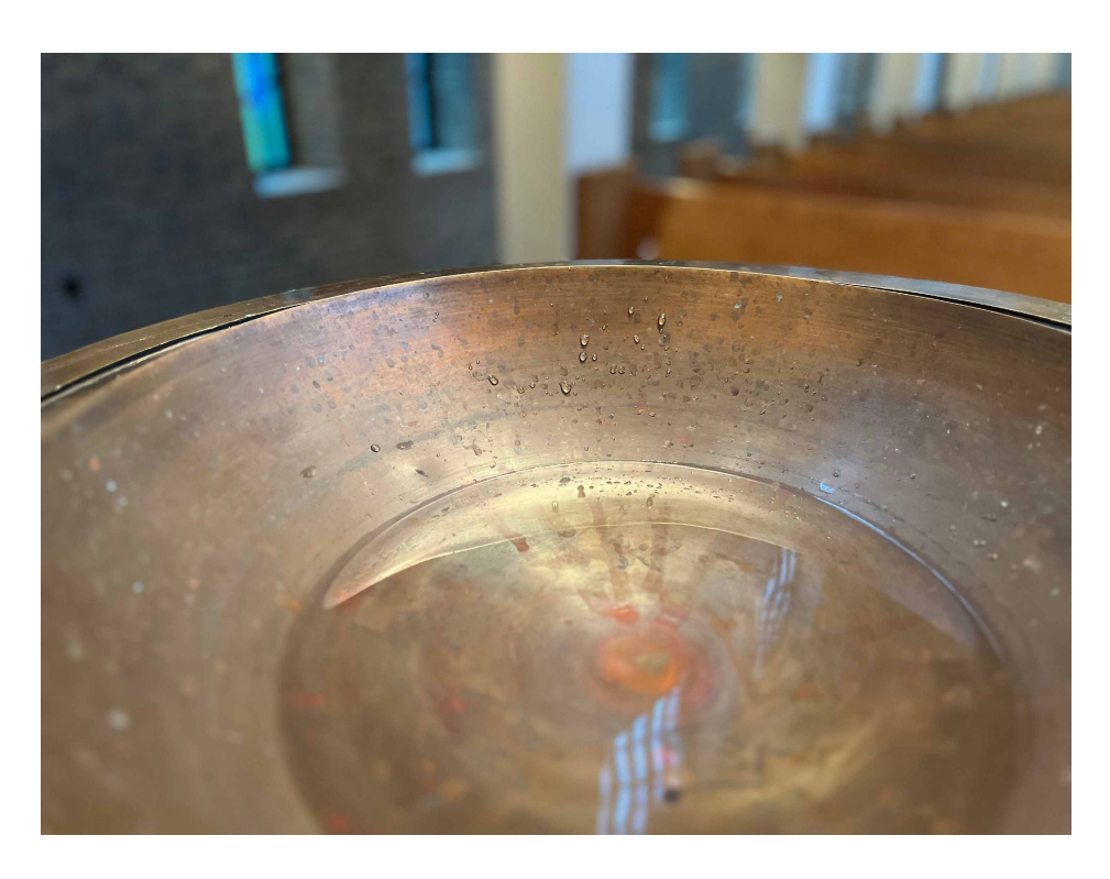
The Order of Worship